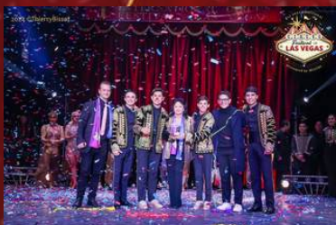
Los Polemicos - Musical Clowns