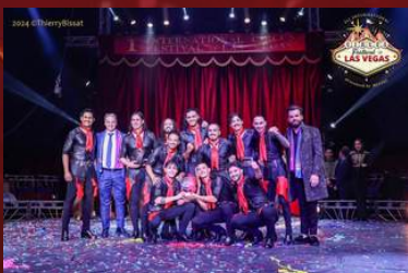
MALEVO - Malambo