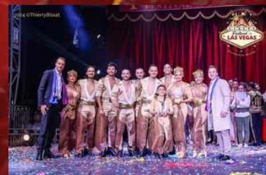
Royal Gauchos - Malambo