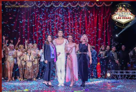
Duo Soma - Perch