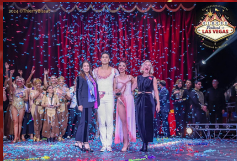
Duo Soma - Perch