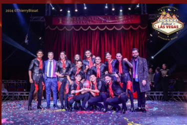
MALEVO - Malambo