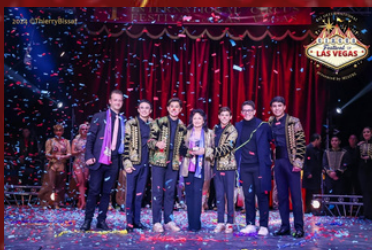
Los Polemicos - Muical Clowns