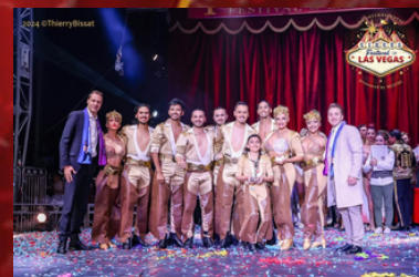
Royal Gauchos - Malambo